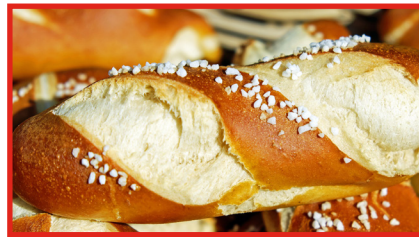
◆ Snacks, Breaks & Beverages