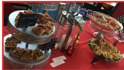
◆ Ambient Displays