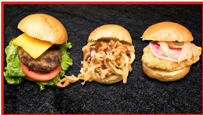
◆ Hot Lunches