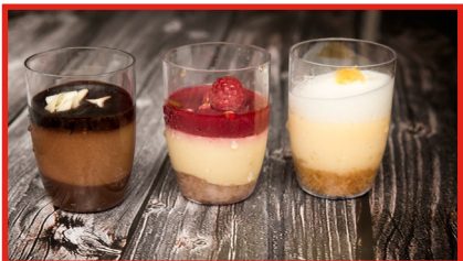
◆ Sweet Indulgences