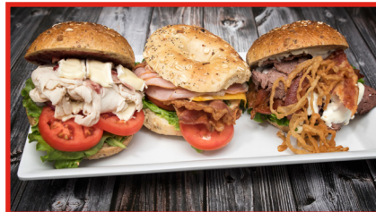
◆ Lunch Presentations