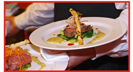
◆ foodwerx facts